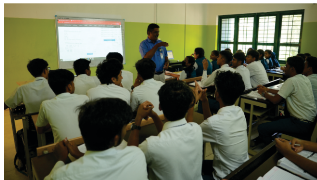
Smart Class Rooms