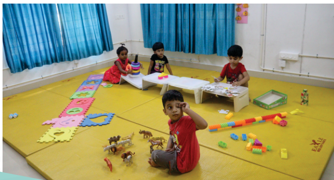
KG Class rooms